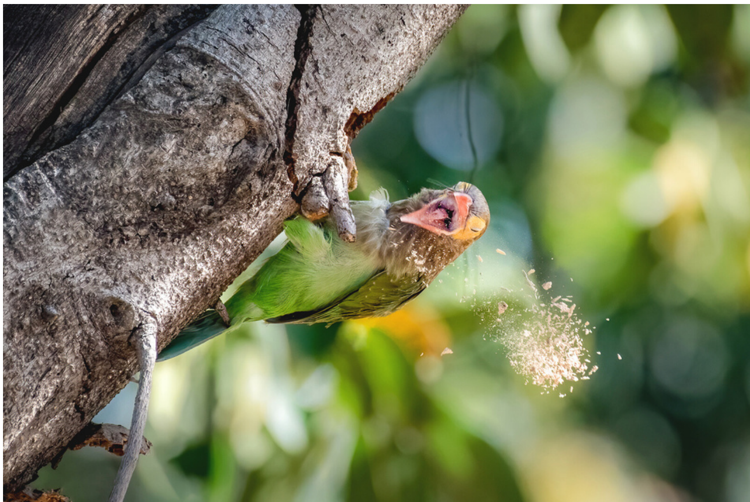
Anuj Jain Chandigarh, Punjab Gear Used: Nikon D750 Lens 200-500mm