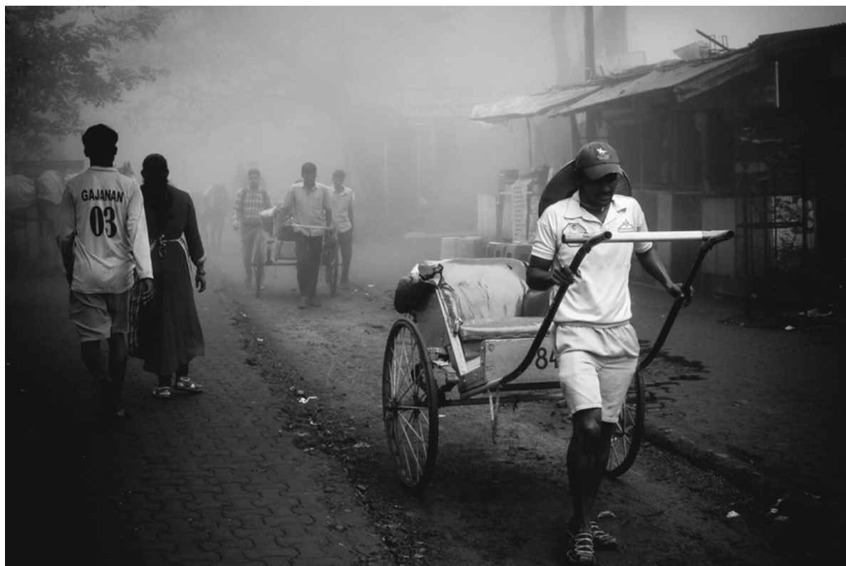
The Art of Survival A Black and white image of a busy street of Matheran Canon 80D, with Tamron 70-300 mm, 1/500 sec, f/4.5, ISO:400.