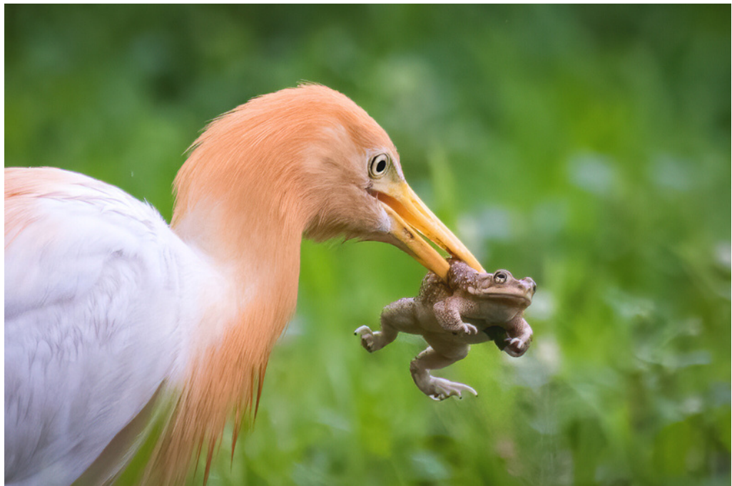
Gear Used: Nikon D750, Lens: 200-500mm