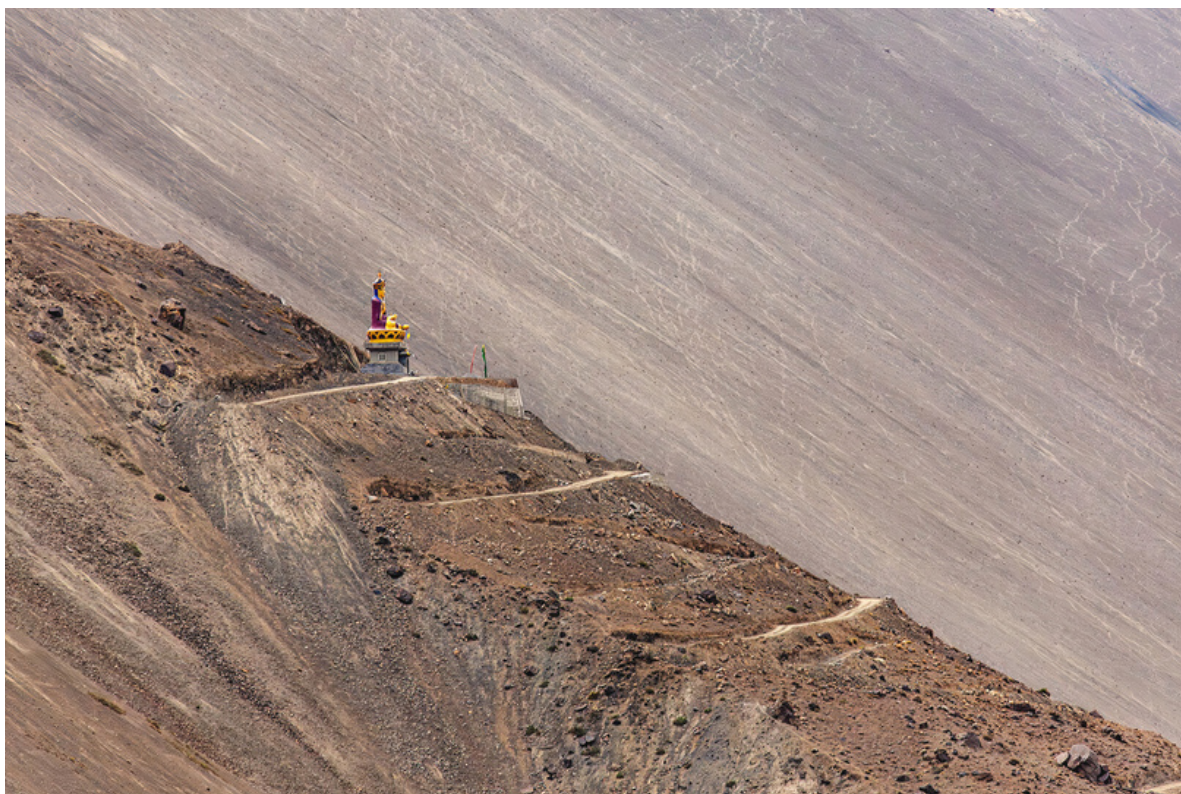
Buddha In Tabo Canon 5D Mark III Lens 150-500mm ISO 500 SS 1/500 f/11 Focal Length 500mm